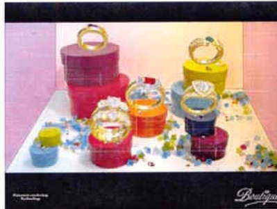
Click Here to Enlarge Picture

The company's patented rendering technology can